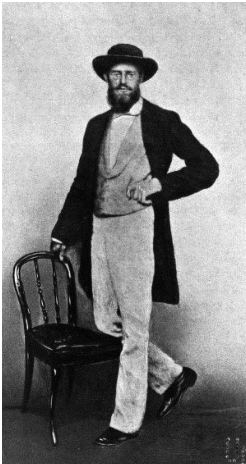
Figure 1. Alfred Russel Wallace as a young man in Singapore in 1862, at the start of his expedition around the Malay Archipelago.

Department of Life Sciences, Terrestrial Invertebrates Division, Natural History Museum, Cromwell Road, London SW7 5BD, UK