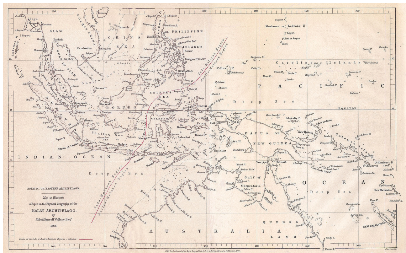
Figure 2. A map of South East Asia from Wallace's book On the Physical Geography of the Malay Archipelago (Wallace 1863) showing what would become known as the Wallace line, separating faunas with oriental affinities from those with Australian affinities.

We think of human-induced climate change as something of which we, as a species, have only recently become aware, but Wallace was worrying about this in the 19th century. He noticed an article in a gardening periodical in which some subscribers had collated records indicating that certain types of fruits and vegetables could no longer be grown, and ascribed this to human impacts on the climate: " ... clearly